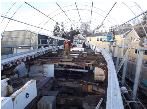
Work on Ernestina-Morrissey progresses daily.