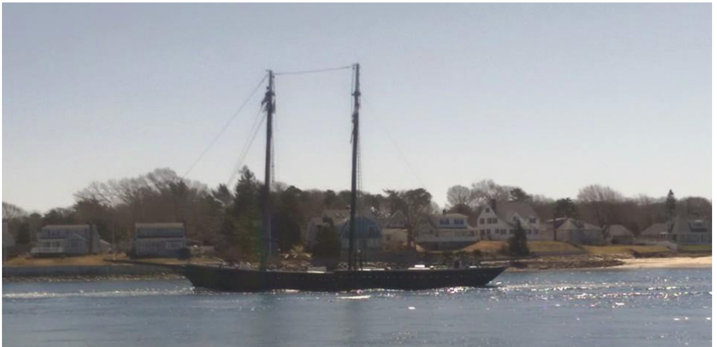
Ernestina-Morrissey is towed through the Cape Cod Canal on April 12, 2015, on her way to Boothbay Harbor for a total hull restoration.

AHA! Cape Verdean Recognition Committee, Inc. Community Foundation of SE Mass. Mass. Dept. of Conservation & Recreation Massachusetts Maritime Academy New Bedford Harbor Sea Chantey Chorus New Bedford Regional Vocational and Technical High School New Bedford Whaling Ntl. Historical Park New Bedford Whaling Museum Onset Cape Verdean Festival Association Working Waterfront Festival