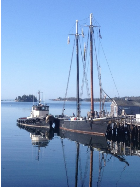
Ernestina-Morrissey arriving safely at the Boothbay Harbor Shipyard, with help from Tug Jaguar.

The biggest highlight of 2015 was that the restoration on Ernestina-Morrissey began.