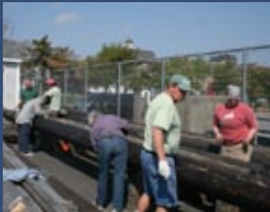
Volunteers oil the spars at a work day in April.

SEMA participated in the following events in 2011: