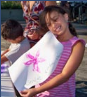
August's AHA! night at Ernestina was a lot of fun with starfish painting and rope bracelet making.