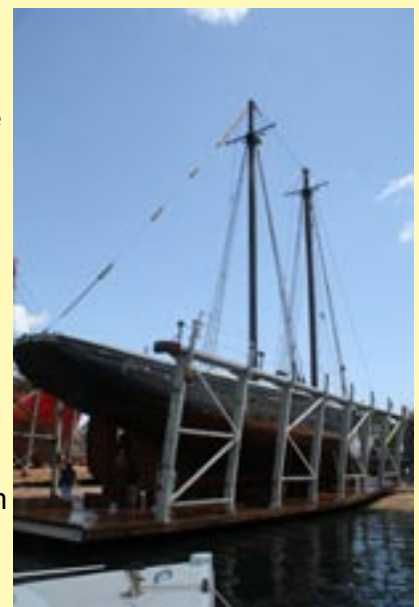
Ernestina was on the rails in Fairhaven for assessment and repairs during summer 2011.

The inspection by Poindexter confirmed an earlier DCR report that stated, "Unfortunately during [inspection] a severe amount of rot was found at the top of the foremast. This rot extends approximately four feet down from the top of the mast and the early prognosis is that the mast will need to be completely replaced." With the funds from SEMA's generous supporters, SEMA was able to purchase the foremast (from a Pacific Northwest Douglas fir) in August. SEMA worked with Mystic Seaport, who also had a shipment for another vessel, to combine the shipments, thus greatly reducing the totally cost of the foremast.