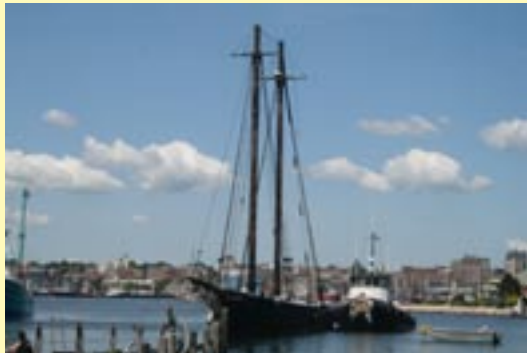
Ernestina gets some help from Tug Jaguar as she crosses New Bedford Harbor in June 2011.

On June 6, the Tug Jaguar took Ernestina alongside and the two vessels traveled in tandem across New Bedford Harbor to the Fairhaven Shipyard, where she would remain for four months for assessment and repairs.