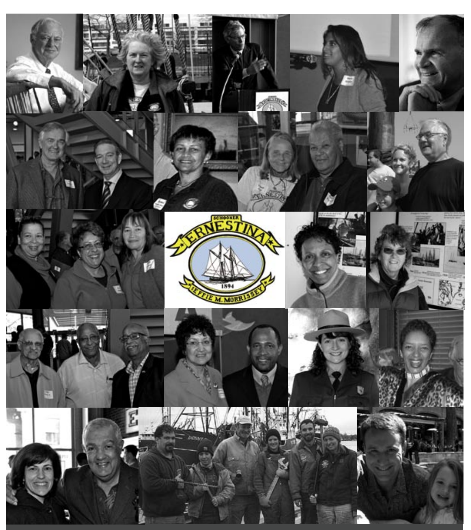
Schooner Ernestina-Morrissey Association, Inc. (SEMA) P.O. Box 2995 New Bedford, MA 02741 www.ernestina.org