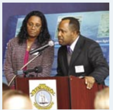
The Consul General of Cape Verde was among the many dignitaries who showed their support at the Forum.

SEMA received its first grant from the Island Foundation to off-