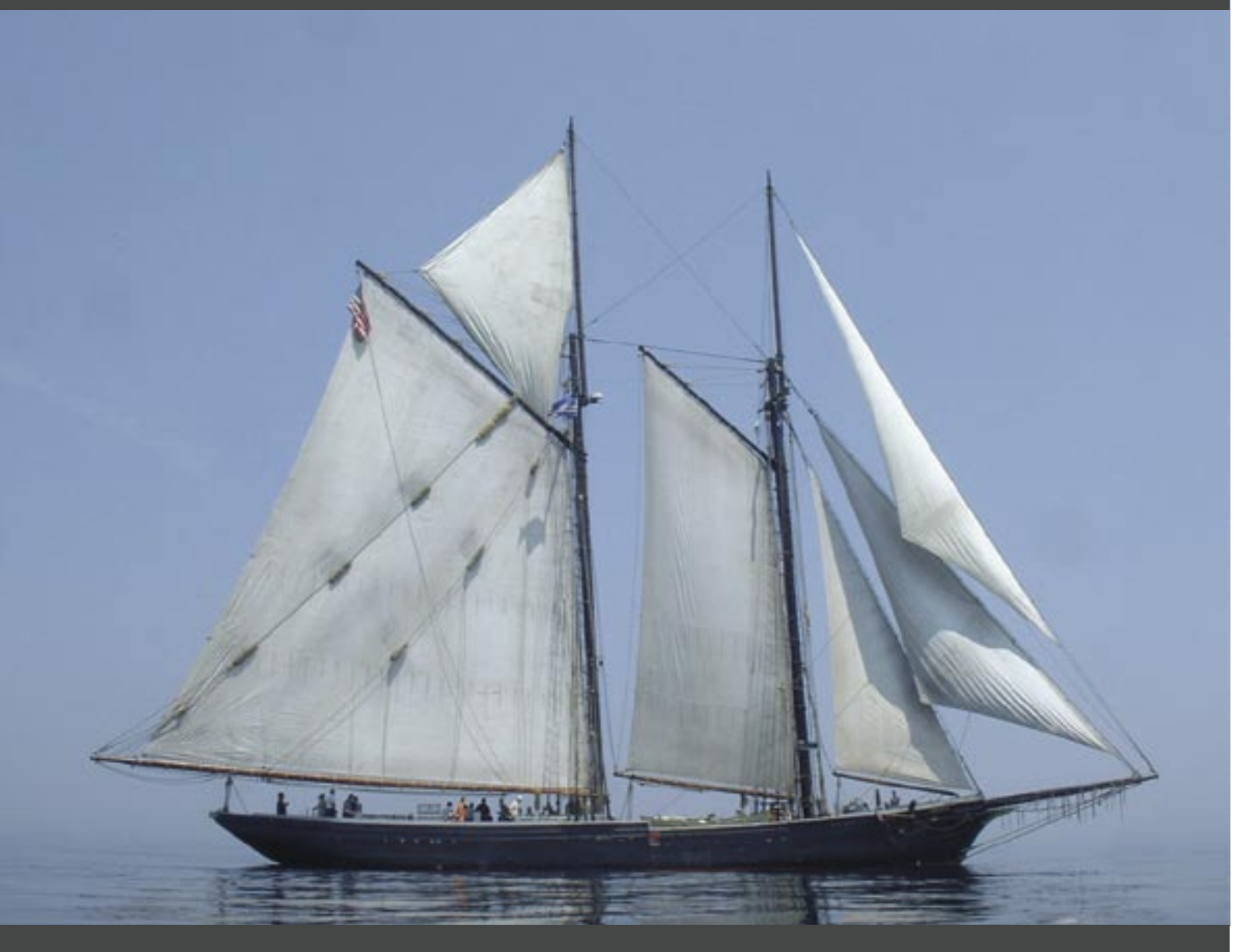
SCHOONER ERNESTINA-MORRISSEY ASSOCIATION 2010 ANNUAL REPORT

Just a few of the many dedicated individuals who are working hard to get her sailing again.