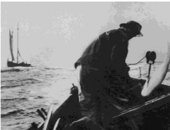
Doryman on the Grand Banks