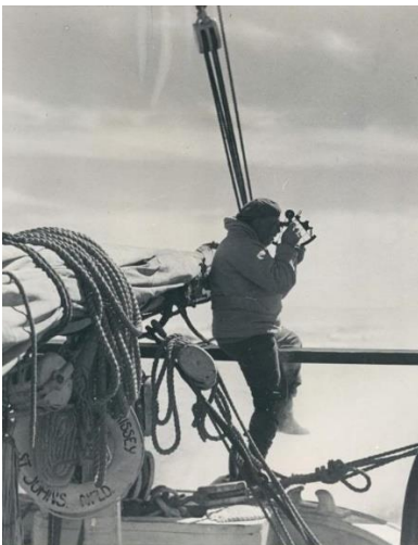
1931 Captain Robert Bartlett taking a sight off Greenland.