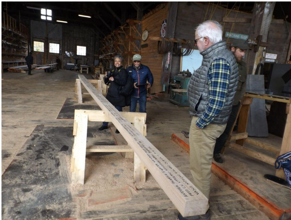
Eighty-six dedications inscribed on the plank.