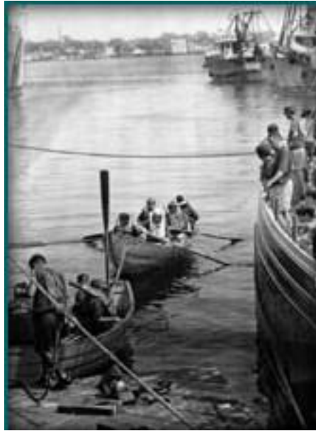
Students rowing dories in New Bedford Harbor, 1997.